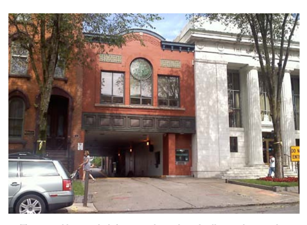
This new addition, which features a drive-through teller window, to a historic Classical Revival-style bank was designed to appear as a compatible infill structure, rather than an addition to the bank.

Although often asked about "infill" construction, the NPS does not have specific guidance because this is technically not a rehabilitation issue. However, the revised Preservation Brief 14 does include a section on new additions in densely built urban environments, which is much the same as infill construction: "A densely-built neighborhood such as a downtown commercial core offers a particular opportunity to design an addition that will have a minimal impact on the historic building. Treating the addition as a separate or infill building may be the best approach when designing an addition that will have the least impact on the historic building and the district. In these instances there may be no need for a direct visual link to the historic building. Height and setback from the street should generally be consistent with those of the historic building and other surrounding buildings in the district. Thus, in most urban