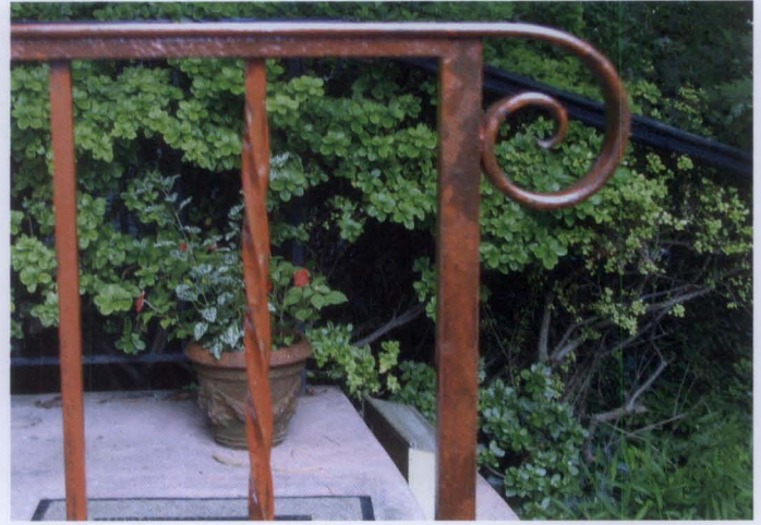
Figure 15. Metal projecting elements on a building, such as sign armatures and railings, are easily subject to rust and decay. Proper surface preparation to remove rust is essential. Special metal primers and topcoats should be used.

Prime and repaint features when necessary and repaint horizontal surfaces on a more frequent basis.