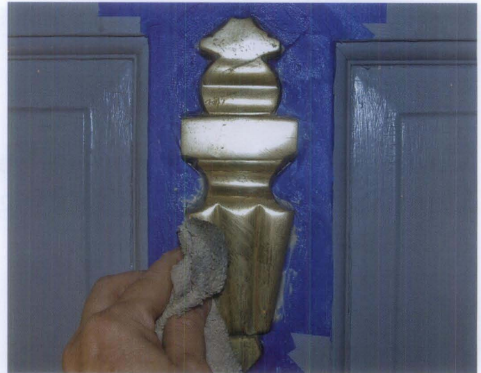
Figure 1. Maintenance involves selecting the proper treatment and protecting adjacent surfaces. Using painter's tape to mask around a brass doorknocker protects the painted door surface from damage when polishing with chemical compounds. On the other hand, hardware with a patinated finish was not intended to be polished and should simply be cleaned with a damp cloth.