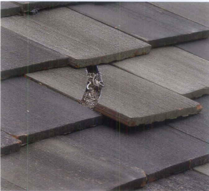
Figure 4. Damage to roofs often requires immediate attention. As a temporary measure, this damaged roof tile could be replaced with a brown aluminum sheet wedged between the existing tiles.