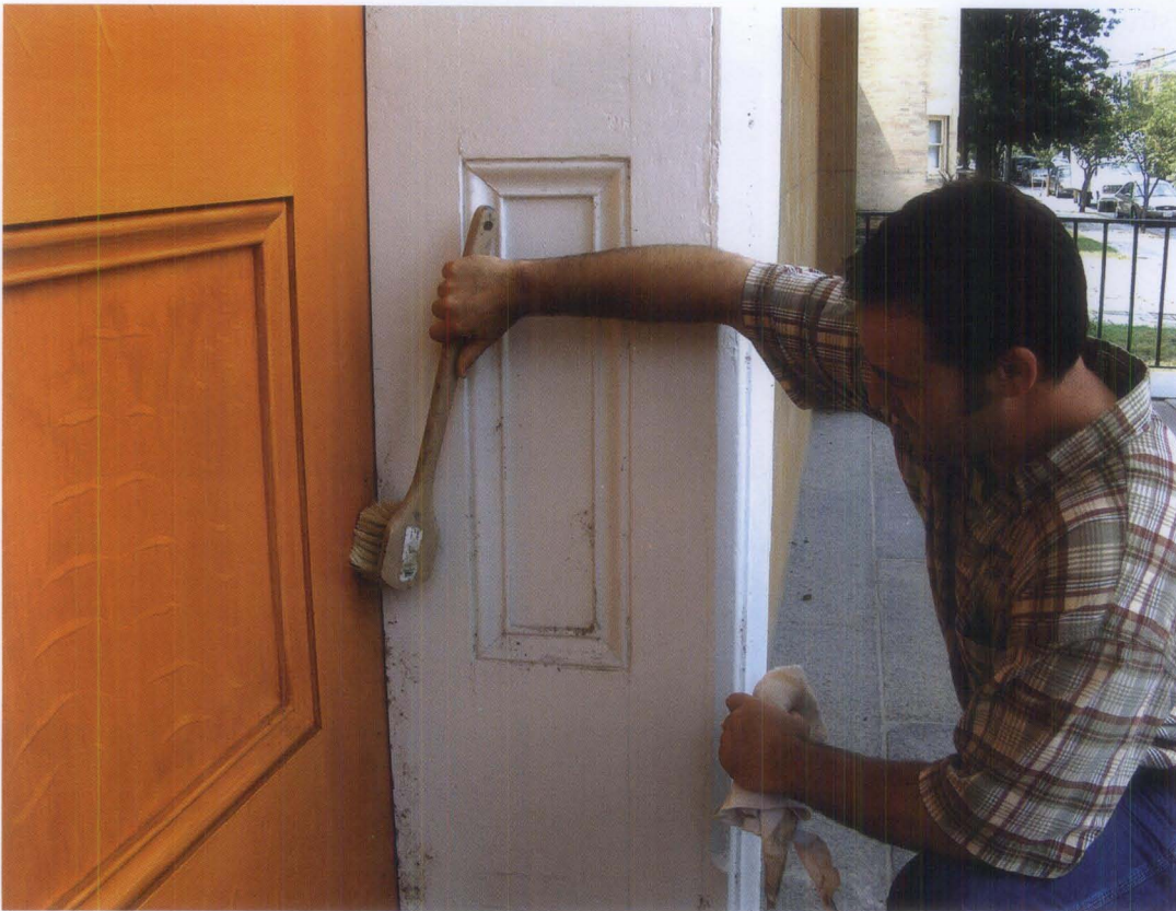
Figure 9. To help extend a repainting cycle, dirt and spider webs should be removed before permanent staining occurs. In this case, a natural bristle brush and a soft damp cloth are being used to remove insect debris and refresh the surface appearance.

scheduled times for cleaning for cosmetic purposes to reduce frequency (Fig 9). When cleaning, use the gentlest means possible; start with natural bristle brushes and water and only add a mild phosphate-free detergent if necessary. Use non-abrasive cleaning methods and low-pressure water from a garden hose. For most building materials, such as wood and brick, avoid abrasive methods such as mechanical scrapers and high-pressure water or air and such additives as sand, natural soda, ice crystals, or rubber products. All abrasives remove some portion of the surface and power-washing drives excessive moisture into wall materials and even into wall cavities and interior walls. If using a mild detergent, two people are recommended, one to brush and one to prewet and rinse. When graffiti or stains are present, consult a preservation specialist who may use poultices or mild chemicals to remove the stain. If the entire building needs cleaning other than described above, consult a specialist.