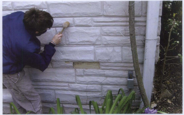
Figure 6. Stucco applied to an exterior wall or foundation was intended to function as a watertight surface. Unless maintained, rainwater will penetrate open joints and cracks that may occur over time. A spalled section of stucco indicates some damage has occurred and a wooden mallet is being used to tap the surface to determine whether the immediate stucco has lost adhesion.

• Wash exterior wall surfaces if dirt or other deposits are causing damage or hiding deterioration; extend