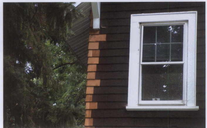
Figure 7. One of the advantages of wood shingles as a wall covering is that individual shingles that are damaged can easily be replaced. On this highly exposed corner, worn shingles have been selectively replaced to help safeguard against water damage. The new shingles will be stained to match the existing shingles.