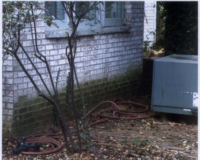
Figure 16. This chronically wet area has a mildew bloom brought on by heat generated from the air-conditioning condenser unit. The dampness could be caused by a clogged roof gutter, improper grading, or a leaking hose bibb.