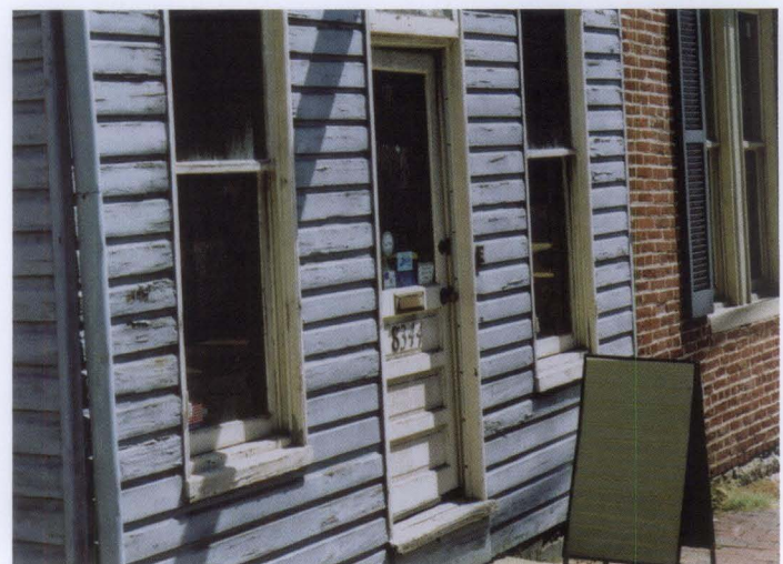
Figure 8. The paint on the siding of this south-facing wall needs to be scraped, sanded, primed and repainted. Postponing such work will lead to further paint failure, require greater preparatory costs, and could even result in the need to replace some siding.