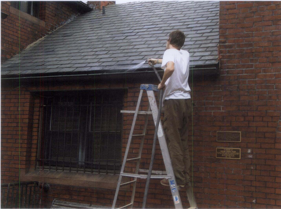
Figure 3. Keeping gutters clean of debris can be one of the most important cyclical maintenance activities. On this small one-story addition, a garden hose is being used to flush out the trough to ensure that the gutter and downspouts are unobstructed. Gutters on most small and medium size buildings can be reached with an extension ladder and a garden hose.

Depending on the nature of the roof, some common conditions of concern to look for are: