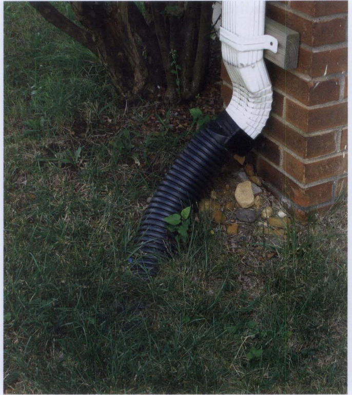
Figure 17. Extending downspouts at their base is one of the basic steps to reduce dampness in basements, crawl spaces and around foundations. Extensions should be buried, if possible, for aesthetics, ease of lawn care, and to avoid creating a tripping hazard.

Historic house journals, maintenance guides for older buildings, preservation consultants, and preservation maintenance firms can assist with writing appropriate procedures for specific properties. Priorities should be established for intervening when unexpected damage occurs such as from broken water pipes or high winds.