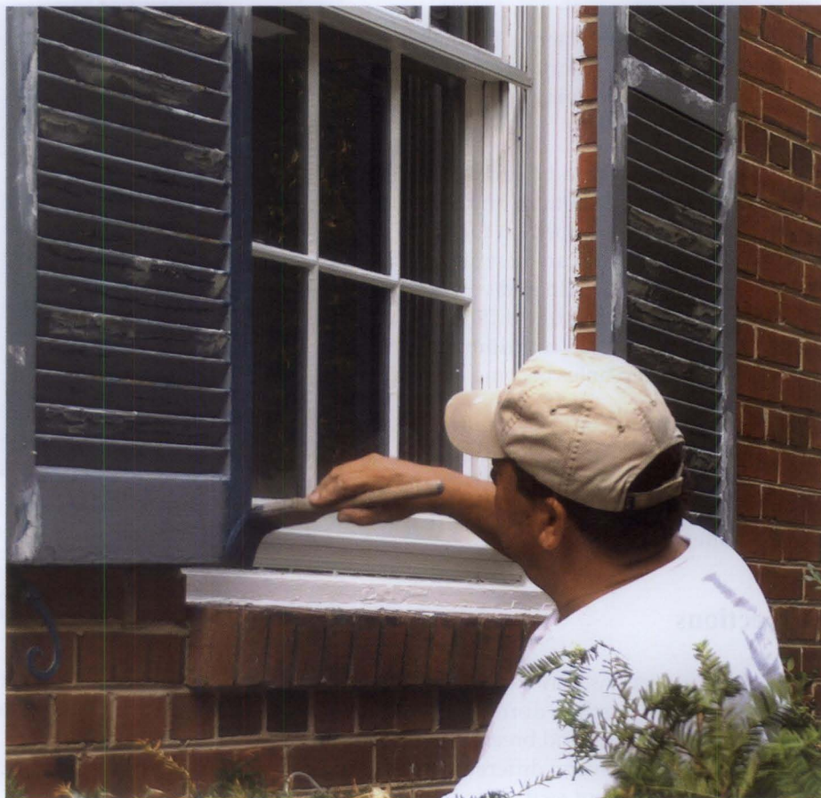
Figure 12. Good surface preparation is essential for long lasting paint. Scraping loose paint, filling nail holes and cracks, sanding, and wiping with a damp cloth prior to repainting are all important steps whether touching up small areas or repainting an entire feature. Always use a manufacturer's best quality paint. Windows and shutters may need repainting every five to seven years, depending on exposure and climate.

• Correct perimeter cracks around windows and doors to prevent water and air infiltration. Use traditional material or modern sealants as appropriate. If fillers such as lead wool have been used, new wool can be inserted with a thin blade tool, taking care to avoid damage to adjacent trim. Reduce excess air infiltration around windows by repairing and lubricating sash locks so that windows close tightly.