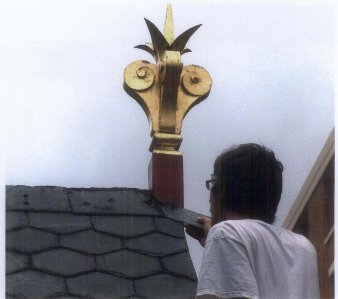
Figure 5. The use of a sealant to close an exposed joint is not always an effective long-term solution. Where this decorative wood element connects to the slate roof, the sealant has failed within a short time and a proper metal flashing collar is being fitted instead.

• Repoint joints in chimneys, parapet, or balustrade capping stones using a hydraulic lime mortar or other suitable mortar where the existing mortar has eroded or cracked, allowing moisture penetration. In general, a mortar that is slightly weaker than the adjacent masonry should be used. This allows trapped moisture in the masonry to migrate out through the mortar and not the masonry. Spalled masonry is often evidence of the previous use of a mortar mix that was too hard.