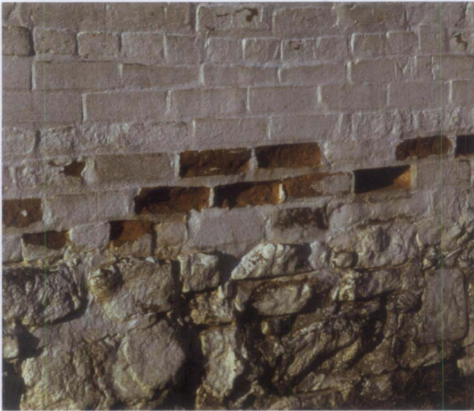
Figure 10. Repointing of masonry should usually be approached as repair rather than maintenance work in part because of the need for a skilled mason familiar with historic mortar. In this case, a moisture condition was not corrected and the use of a waterproof coating and off-the-shelf Portland cement mortar trapped water and resulted in further damage to these 19th century bricks.

one coat of primer and coat end grain that might be exposed with two coats of primer.