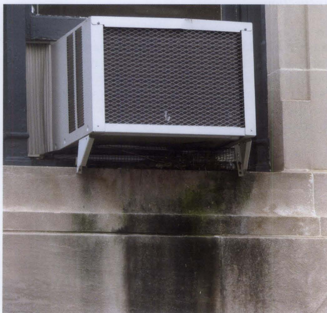
Figure 13. Window air conditioning units can cause damage to surfaces below when condensation drips in an uncontrolled manner. Drip extension tubes can sometimes be added to direct the discharge.