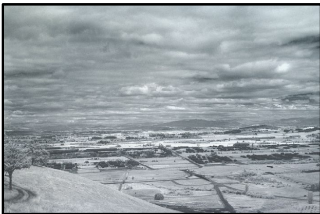
Figure 3 - Construction of Camp Adair & Coffin Butte Road: Overlook of Camp Adair in early 1940s, from slope on Coffin Butte looking east/southeast (photo from the Salem, OR Library's "Ben Maxwell Collection").