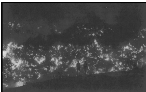
Figure 6 - August 25, 1999.

Operations at Coffin Butte changed little in the early 2000s. On December 31, 2000, Benton County renewed its Franchise Agreement with Valley Landfills. A specification of that Agreement was to establish a Baseline for determining and measuring adverse effects of the Landfill. In 2001, a 322-page Baseline Study was completed by the Benton County Health Department. Benton County did not insist on a similar specification in the 2020 franchise agreement. Throughout this period, the Solid Waste Advisory Council was very active, frequently posting notices in the local paper. In November of 2002, the Benton County Board of Commissioners signed a Memorandum of Understanding with Valley Landfills stating that Valley Landfills, Inc (VLI), "will not conduct, without the prior approval of Benton County and the State of Oregon, the placement of solid waste on the approximate 56 acres, within the landfill zone which it owns south of Coffin Butte Road." 44 The required Benton County