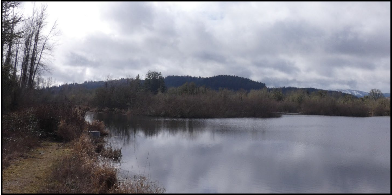
Figure 5 - View of E.E. Wilson Wetlands opposite Angler's Pond, 2023.

The Coffin Butte Landfill and the E.E. Wilson Wildlife Area are located at the midpoint of a triangle of National Wildlife Refuges. This National Wildlife Refuges (refuges or NWRs) system, managed by the U.S. Fish and Wildlife Service, was established in the mid-Willamette Valley during the 1960s when the Migratory Bird Commission approved the establishment of three refuges: Ankeny, Basket Slough, and William L. Finley.