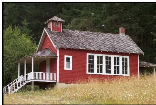
Figure 4 - Soap Creek Schoolhouse.

Today, the unusually cohesive Soap Creek community works together to restore and maintain the Soap Creek Schoolhouse, a symbol of the valley. Built in 1935 and in use until 1946, the structure was restored by the community and remains a meeting place for local activities and an annual fundraising event. 16