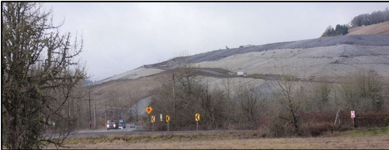
Figure 7 - View of Coffin Butte Landfill, Feb. 2023, from E.E. Wilson Archery Park.