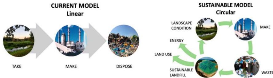
Figure 4. Current and future model of landfilling.