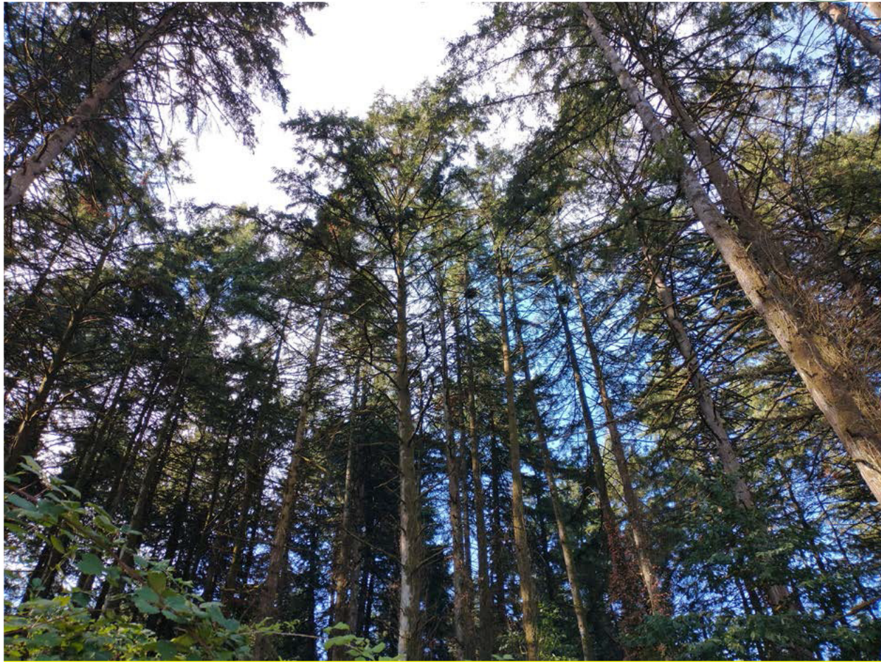
Figure 5. Western Rookery (#2683) with a Fairly Open Understory (photo taken 10/7/2021)