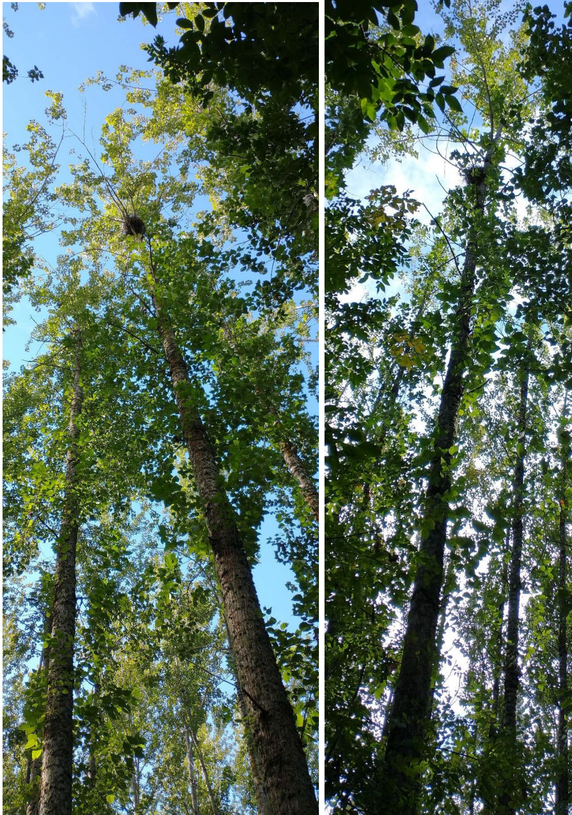
Figure 2. Great Blue Heron Nest Trees in the Eastern Rookery #2716 (photo taken 10/7/2021)