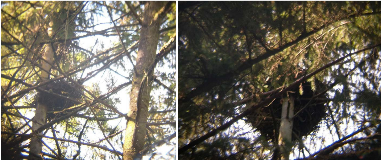
Figure 3. Nests in Douglas-fir Trees in the Western Rookery #2683 (photo taken 10/7/2021)

James observed 12 stick nests in 8 active nest trees in the western rookery (Figure 3). The nests were approximately 18 to 36 inches in width, 70 to 100 feet in height, and did not appear active this year (2021) with no visible whitewash. The nests appeared to be intact and were likely built upon in the last 2 to 3 years.