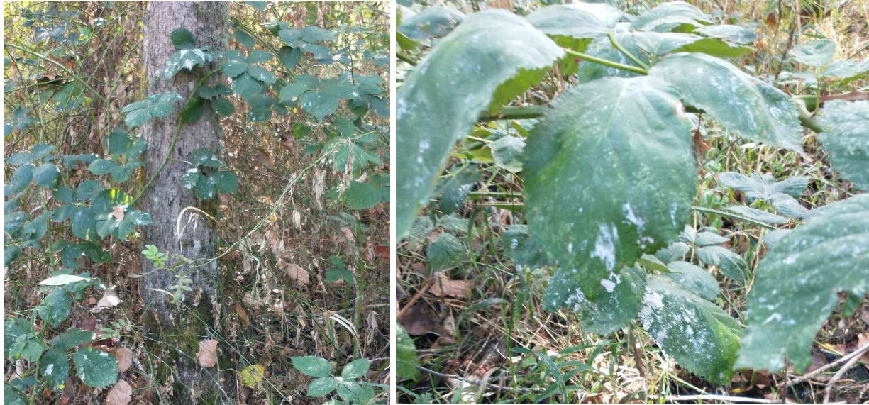
Figure 1. Whitewash below Great Blue Heron Rookery #2716 (photo taken 10/7/2021)

The hybrid poplars were planted as a noise reduction measure. Accordingly, this rookery is in an area with very high noise levels during the landfill's operating hours.