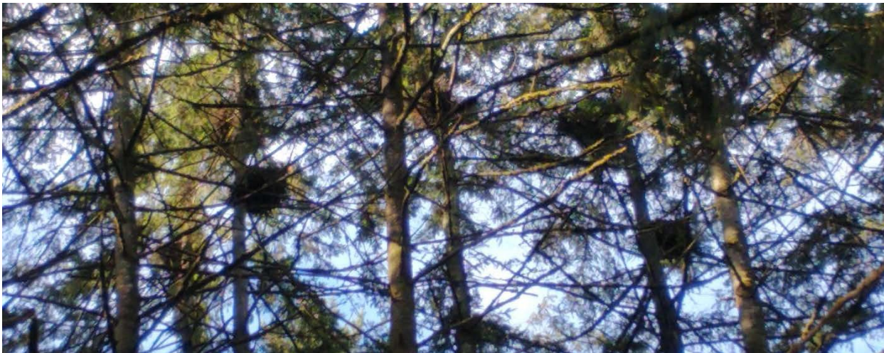
Figure 4. Great Blue Heron Nests in the Western Rookery #2683 (photo taken 10/7/2021)